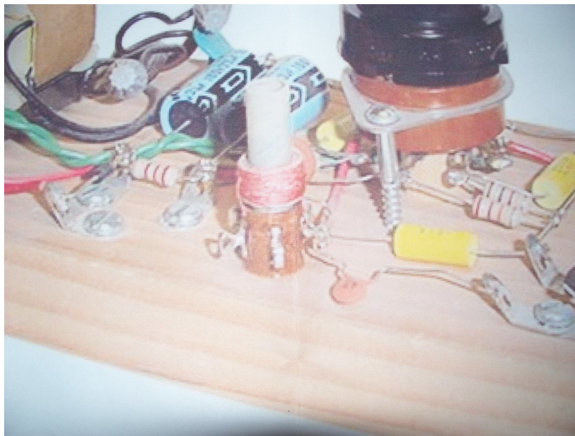
Illustration 2: Part of the photograph included in the kit box

The problem stems from the oscillator coil being inserted upside-down. Since the coil has 5 terminals, only 3 of which are used, when you invert it, you use terminals 1, 2 and 5, rather than 1, 2 and 3. The red dot on the coil, between terminals 1 and 2 is still placed in the same location, but the terminals are reversed. Terminals 4 and 5 are connected to another winding on the coil, but not used in this kit. So, when it's inserted wrong, one lead is connected to one end of a coil that is not connected to anything on the other end.