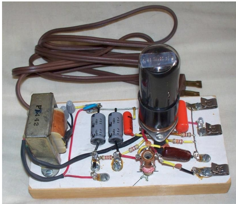
Illustration 1: The KT 488 as received